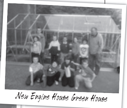
New Engine House Green House