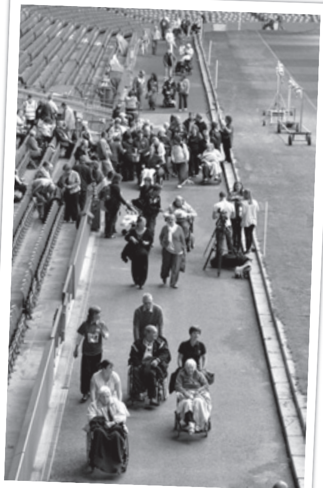
Over 150 people joined the walk

For information and advice about stroke, call The Stroke Helpline on 0303 3033 100 or visit www.stroke.org.uk