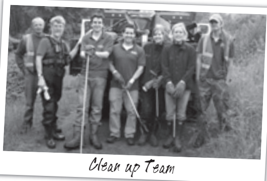
Clean up Team

Our principle way of combating these problems is our Tidy Towns Project in which local volunteers both within community groups and as individuals (litter champions) carry out a variety of projects in their community. These volunteers are supported by KWT with training, insurance and equipment from a dedicated Project Officer. KWT liaises between these groups and statutory organisations including the Environment Agency and local authority to help with removal of waste after events, provision of extra manpower and enforcement of litter and flytipping laws.