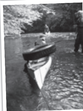
Quakers Yard Rapids