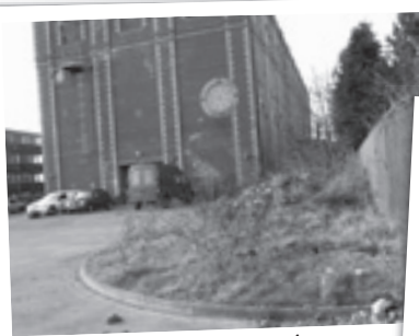
Engine House Before

For further information contact the Boys and Girls Club on 01685 375314